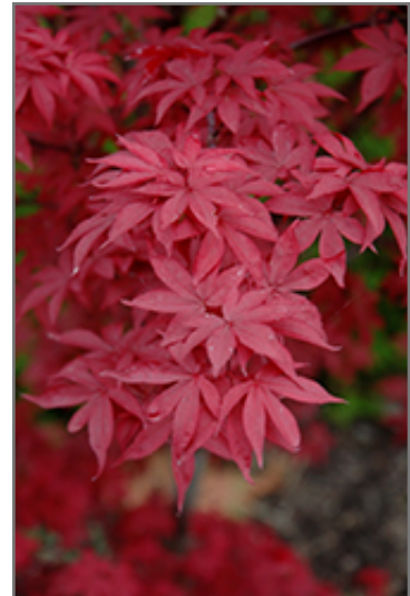
Twombly's Red Sentinel Japanese Maple foliage

Twombly's Red Sentinel Japanese Maple is recommended for the following landscape applications;