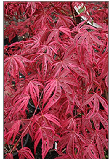
Shirazz Japanese Maple foliage