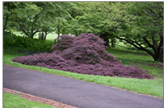
Garnet Cutleaf Japanese Maple