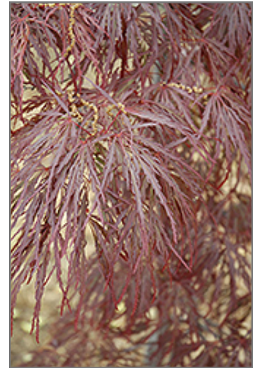
Garnet Cutleaf Japanese Maple foliage

This is a relatively low maintenance shrub, and should only be pruned in summer after the leaves have fully developed, as it may 'bleed' sap if pruned in late winter or early spring. It has no significant negative characteristics.