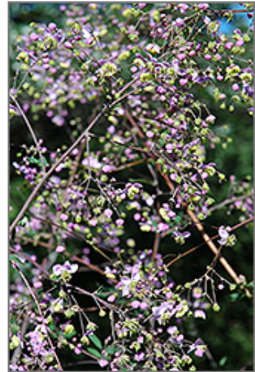
Rochebrun Meadow Rue flowers