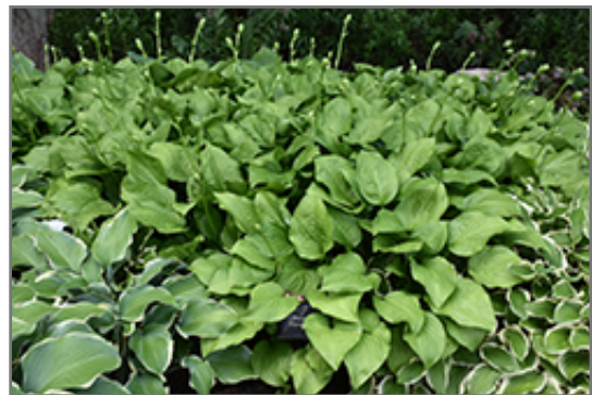
Royal Standard Hosta