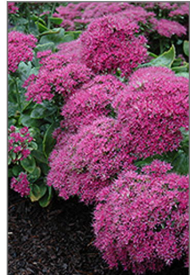
Neon Stonecrop flowers

Neon Stonecrop is a dense herbaceous perennial with an upright spreading habit of growth. Its relatively coarse texture can be used to stand it apart from other garden plants with finer foliage.