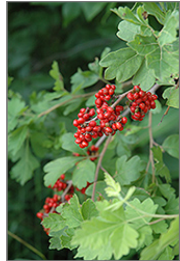
Fragrant Sumac fruit