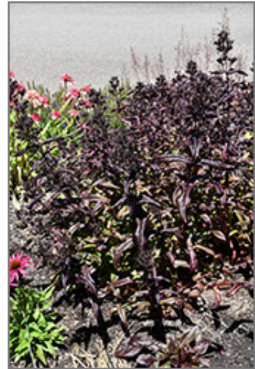
Dakota Burgundy Beard Tongue

Dakota Burgundy Beard Tongue is a fine choice for the garden, but it is also a good selection for planting in outdoor pots and containers. With its upright habit of growth, it is best suited for use as a 'thriller' in the 'spiller-thriller-filler' container combination; plant it near the center of the pot, surrounded by smaller plants and those that spill over the edges. Note that when growing plants in outdoor containers and baskets, they may require more frequent waterings than they would in the yard or garden.