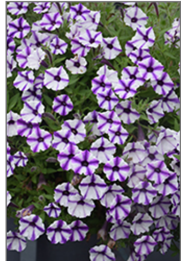
Supertunia Mini Vista Violet Star Petunia flowers

Supertunia Mini Vista Violet Star Petunia is a dense herbaceous annual with a trailing habit of growth, eventually spilling over the edges of hanging baskets and containers. Its medium texture blends into the garden, but can always be balanced by a couple of finer or coarser plants for an effective composition.