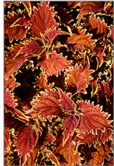
Copperhead Coleus foliage

Copperhead Coleus is recommended for the following landscape applications;