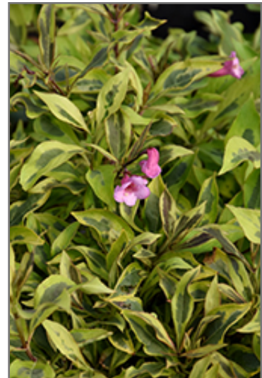
Bubbly Wine Weigela flowers