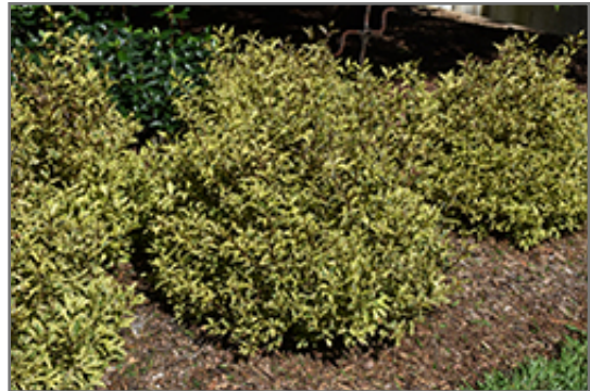
Bubbly Wine Weigela

Bubbly Wine Weigela will grow to be about 24 inches tall at maturity, with a spread of 3 feet. It tends to fill out right to the ground and therefore doesn't necessarily require facer plants in front. It grows at a medium rate, and under ideal conditions can be expected to live for approximately 30 years.