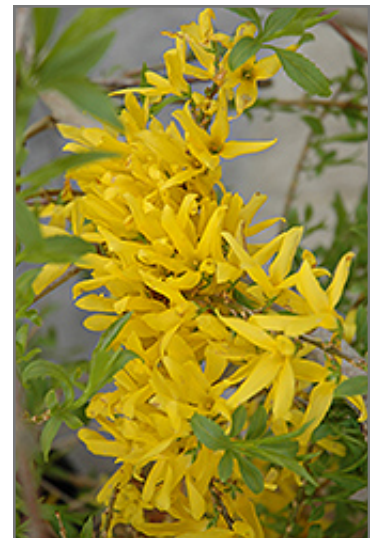
Gold Tide Forsythia flowers

Gold Tide Forsythia is recommended for the following landscape applications;