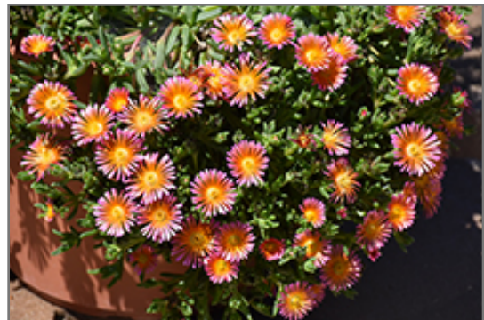
Ocean Sunset Orange Glow Ice Plant flowers