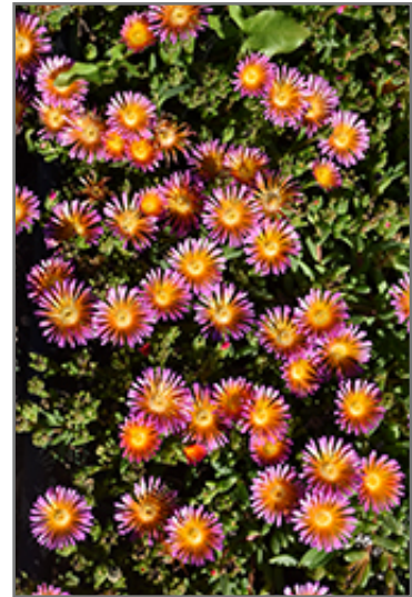
Ocean Sunset Orange Glow Ice Plant flowers

Ocean Sunset Orange Glow Ice Plant is a fine choice for the garden, but it is also a good selection for planting in outdoor pots and containers. Because of its spreading habit of growth, it is ideally suited for use as a 'spiller' in the 'spiller-thriller-filler' container combination; plant it near the edges where it can spill gracefully over the pot. Note that when growing plants in outdoor containers and baskets, they may require more frequent waterings than they would in the yard or garden.