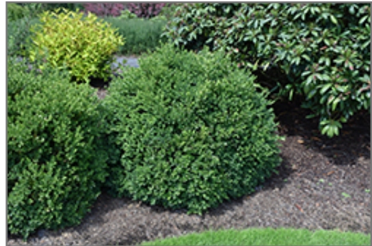
Green Velvet Boxwood

Green Velvet Boxwood is recommended for the following landscape applications;