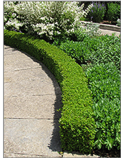
Green Velvet Boxwood

Green Velvet Boxwood makes a fine choice for the outdoor landscape, but it is also well-suited for use in outdoor pots and containers. Because of its height, it is often used as a 'thriller' in the 'spiller-thriller-filler' container combination; plant it near the center of the pot, surrounded by smaller plants and those that spill over the edges. It is even sizeable enough that it can be grown alone in a suitable container. Note that when grown in a container, it may not perform exactly as indicated on the tag - this is to be expected. Also note that when growing plants in outdoor containers and baskets, they may require more frequent waterings than they would in the yard or garden.