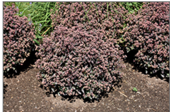
Rock 'N Grow Tiramisu Stonecrop in bloom