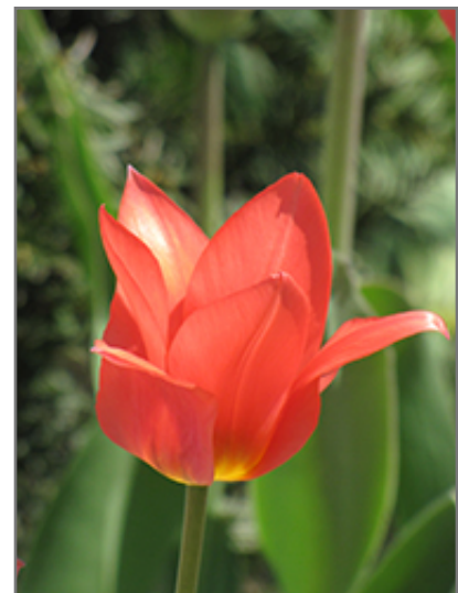
Red Emperor Tulip flowers