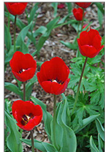
Bastogne Tulip flowers