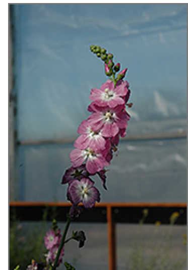
Stark's Hybrids Prairie Mallow flowers