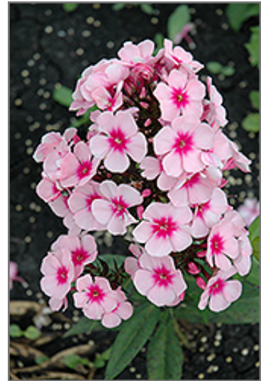
Bright Eyes Garden Phlox flowers

Bright Eyes Garden Phlox is a fine choice for the garden, but it is also a good selection for planting in outdoor pots and containers. With its upright habit of growth, it is best suited for use as a 'thriller' in the 'spiller-thriller-filler' container combination; plant it near the center of the pot, surrounded by smaller plants and those that spill over the edges. It is even sizeable enough that it can be grown alone in a suitable container. Note that when growing plants in outdoor containers and baskets, they may require more frequent waterings than they would in the yard or garden.