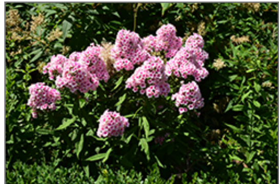
Bright Eyes Garden Phlox in bloom