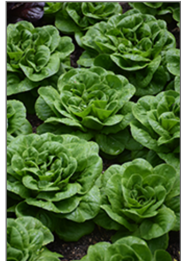
Buttercrunch Lettuce

Buttercrunch Lettuce will grow to be about 12 inches tall at maturity, with a spread of 6 inches. When planted in rows, individual plants should be spaced approximately 8 inches apart. This vegetable plant is an annual, which means that it will grow for one season in your garden and then die after producing a crop. Because of its relatively short time to maturity, it lends itself to a series of successive plantings each staggered by a week or two; this will prolong the effective harvest period.