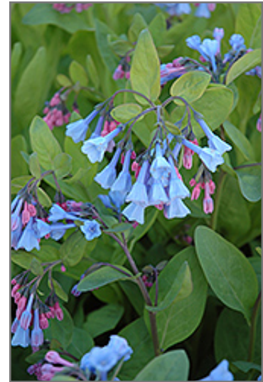
Virginia Bluebells flowers