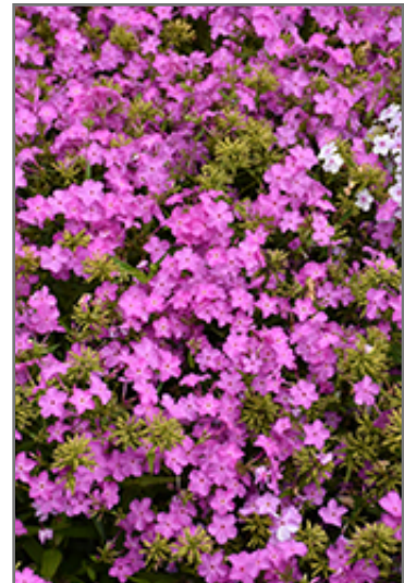
Opening Act Ultrapink Phlox flowers