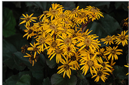
Britt Marie Crawford Rayflower flowers