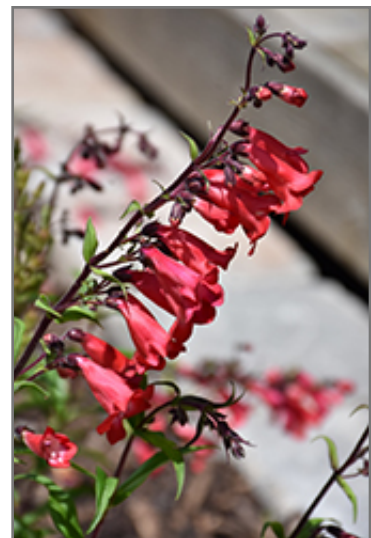
Cherry Sparks Beard Tongue flowers