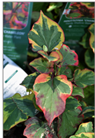
Variegated Chameleon Plant foliage