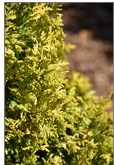
Soft Serve Gold Falsecypress foliage