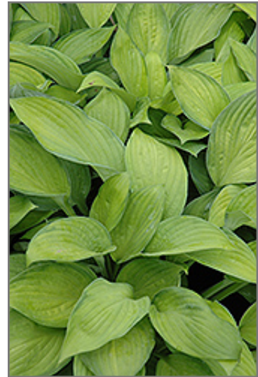
Gold Standard Hosta foliage