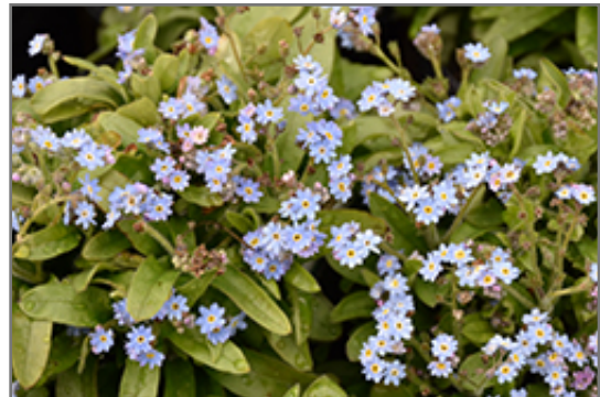
Victoria Blue Forget-Me-Not flowers