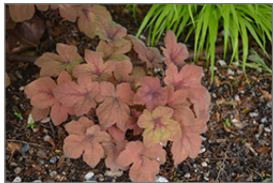
Pumpkin Spice Foamy Bells