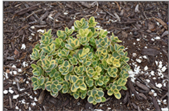
Lime Twister Stonecrop