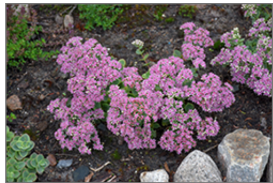
Lime Twister Stonecrop in bloom