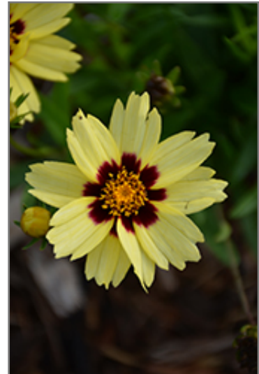
UpTick Cream and Red Tickseed flowers

This is a relatively low maintenance plant, and is best cleaned up in early spring before it resumes active growth for the season. It is a good choice for attracting bees and butterflies to your yard, but is not particularly attractive to deer who tend to leave it alone in favor of tastier treats. It has no significant negative characteristics.