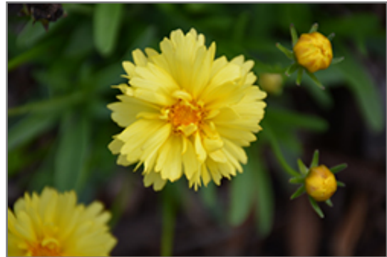
Leading Lady Charlize Tickseed flowers

Leading Lady Charlize Tickseed is recommended for the following landscape applications;