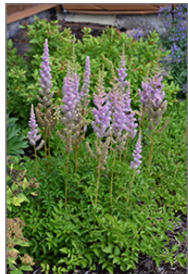
Dwarf Chinese Astilbe in bloom