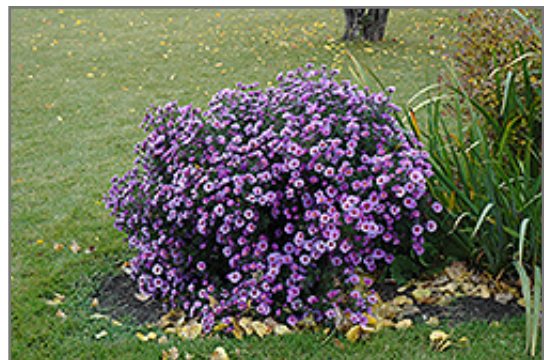
Purple Dome Aster in bloom