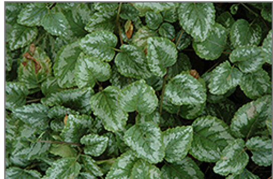
Jade Frost Archangel foliage