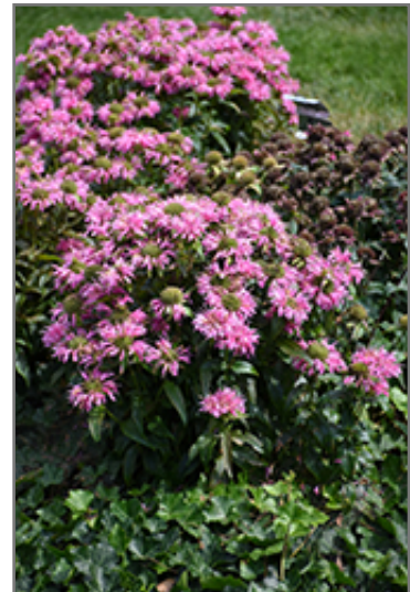
Pardon My Pink Beebalm in bloom Photo courtesy of NetPS Plant Finder