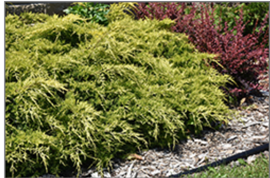
Gold Lace Juniper

This is a relatively low maintenance shrub, and is best pruned in late winter once the threat of extreme cold has passed. Deer don't particularly care for this plant and will usually leave it alone in favor of tastier treats. It has no significant negative characteristics.