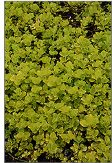
Golden Creeping Jenny foliage

Golden Creeping Jenny is recommended for the following landscape applications;