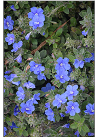
Blue My Mind Morning Glory flowers

Blue My Mind Morning Glory is recommended for the following landscape applications;