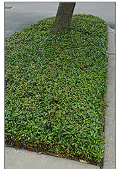
Asian Jasmine

Asian Jasmine is recommended for the following landscape applications;