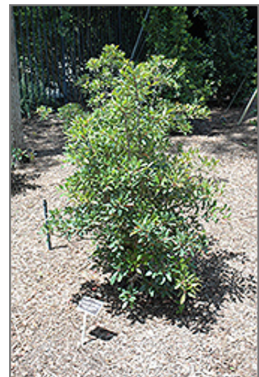
Bronze Beauty Cleyera