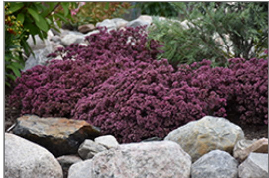
Cherry Tart Stonecrop in bloom

Cherry Tart Stonecrop is a dense herbaceous perennial with an upright spreading habit of growth. Its medium texture blends into the garden, but can always be balanced by a couple of finer or coarser plants for an effective composition.