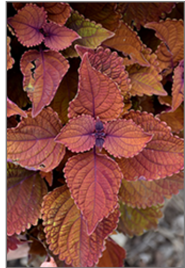
Wall Street Coleus foliage