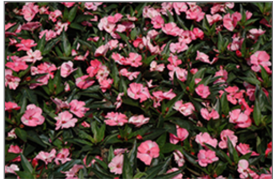
SunPatiens Spreading Pink Flash New Guinea Impatiens flowers

This plant will require occasional maintenance and upkeep, and should not require much pruning, except when necessary, such as to remove dieback. It is a good choice for attracting bees and butterflies to your yard. It has no significant negative characteristics.