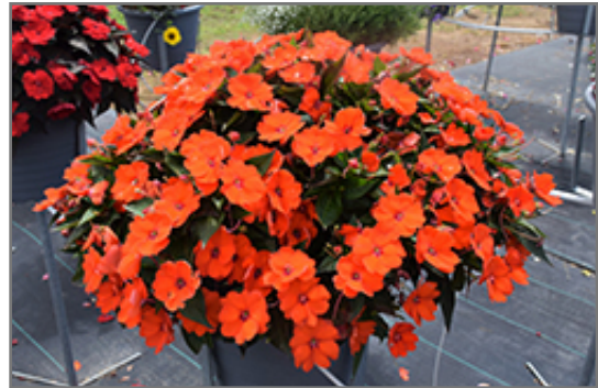
SunPatiens Compact Electric Orange New Guinea Impatiens in bloom