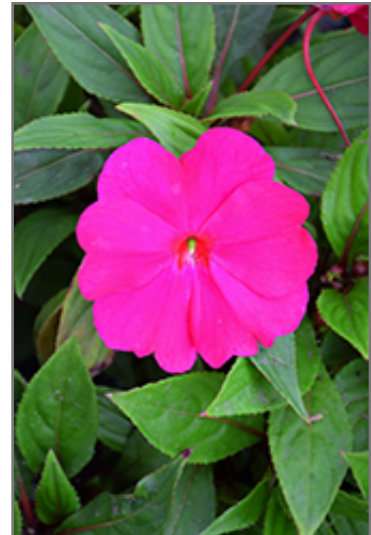
Divine Violet New Guinea Impatiens flowers

Divine Violet New Guinea Impatiens is recommended for the following landscape applications;