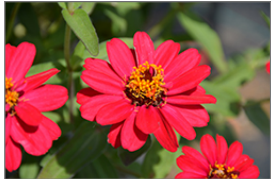
Profusion Double Hot Cherry Zinnia flowers

Profusion Double Hot Cherry Zinnia is recommended for the following landscape applications;