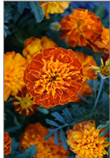
Bonanza Harmony Marigold flowers

Bonanza Harmony Marigold is recommended for the following landscape applications;