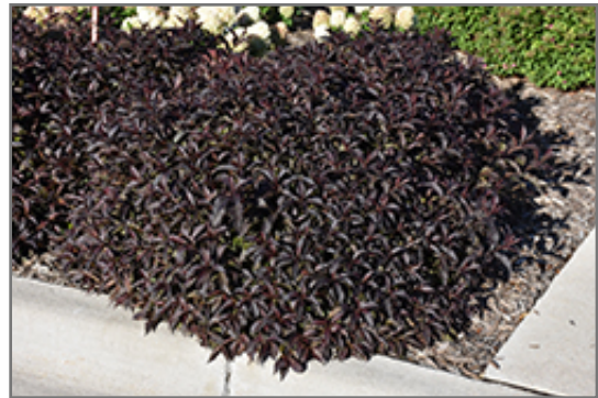
Spilled Wine Weigela