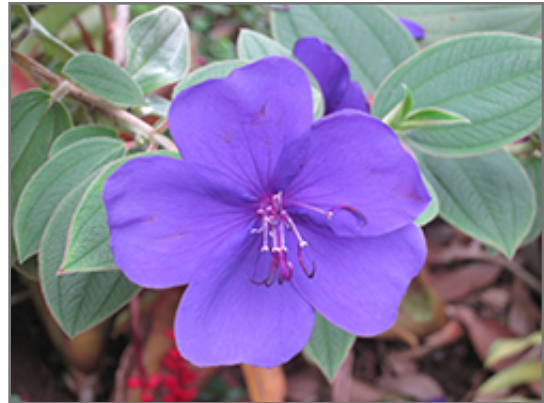
Princess Flower flowers

This shrub will require occasional maintenance and upkeep, and is best pruned in late winter once the threat of extreme cold has passed. It is a good choice for attracting butterflies to your yard. It has no significant negative characteristics.